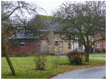
Spittle House is a former monastic leper hospital, the name deriving from "hospital" rather than saliva! The western range may date from the 1300s. Although private, it can be viewed from the adjacent footpath.