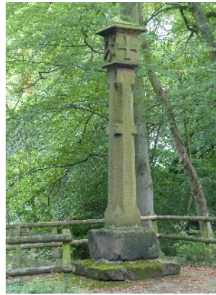
The base of Mottram Cross is medieval. The shaft was rebuilt in 1832 by the Wright family of Mottram Hall, whose arms appear on the head of the cross.